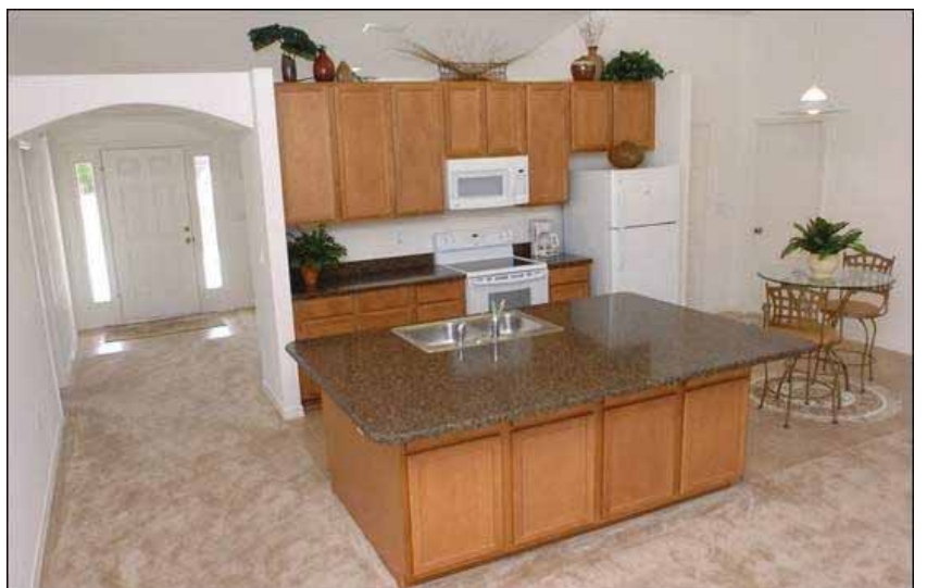
Open spaces. The Gulfstream model's kitchen, above, includes a 5-by-8-foot island. Below, the patio is screened in and overlooks the backyard.

"Larry tried to incorporate into the house everything that's important to people," Wiltshire said, noting the master bath includes dual sinks, a garden tub, separate shower and private commode.