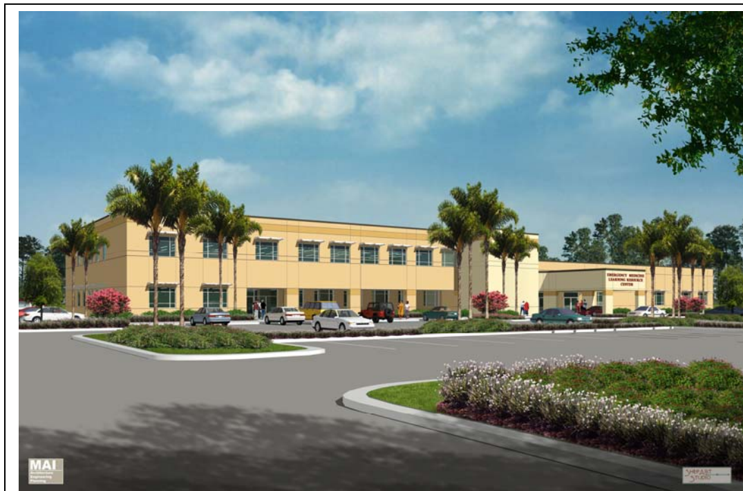
Emergency Medicine Learning Resource Center is also by MAI Design Build